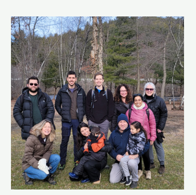
Hike with Wildlands Conservancy