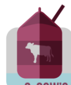
3. COW'S MILK