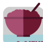
8. OATMEAL AND FORTIFIED CEREALS